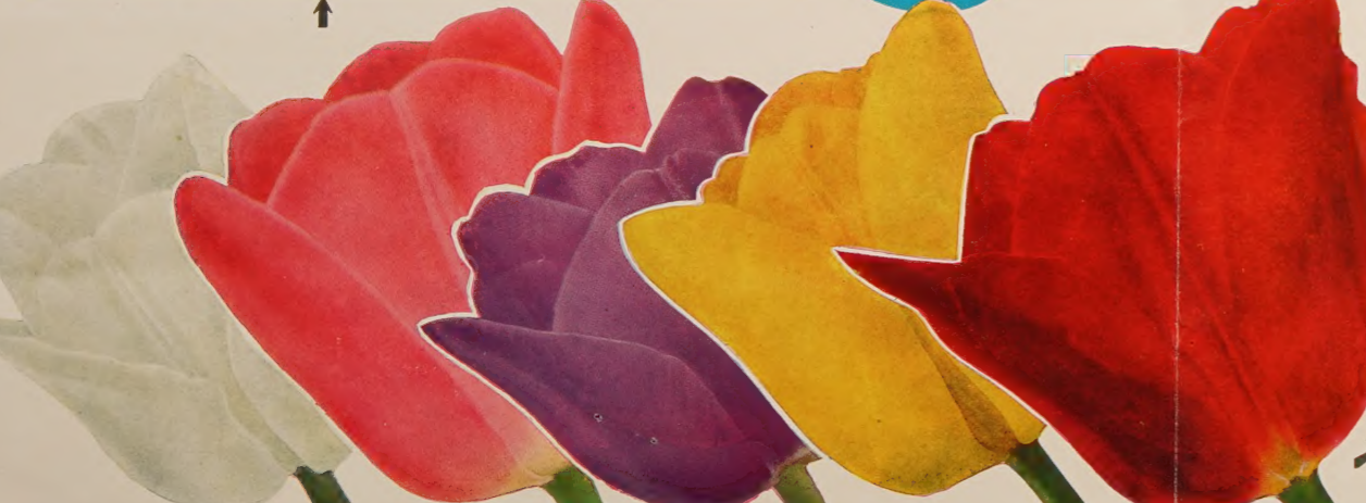
ZWANENBURG 12 for $1.10 PRINCESS ELIZABETH MAX 12 for $1.00 BLEU AIMABLE 12 for $1.00 GOLDEN AGE 12 for $1.10 FARNCOMBE SANDERS 12 for 85c

Collection K 10 bulbs each of 5 Darwin varieties illustrated below 50 for $3.80